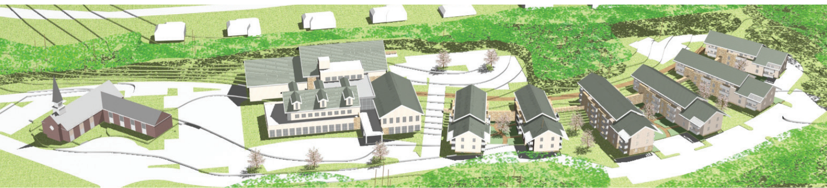
Artistic rendition of the Family Community Life Center.

1018 Northville Turnpike • Riverhead, New York 11901