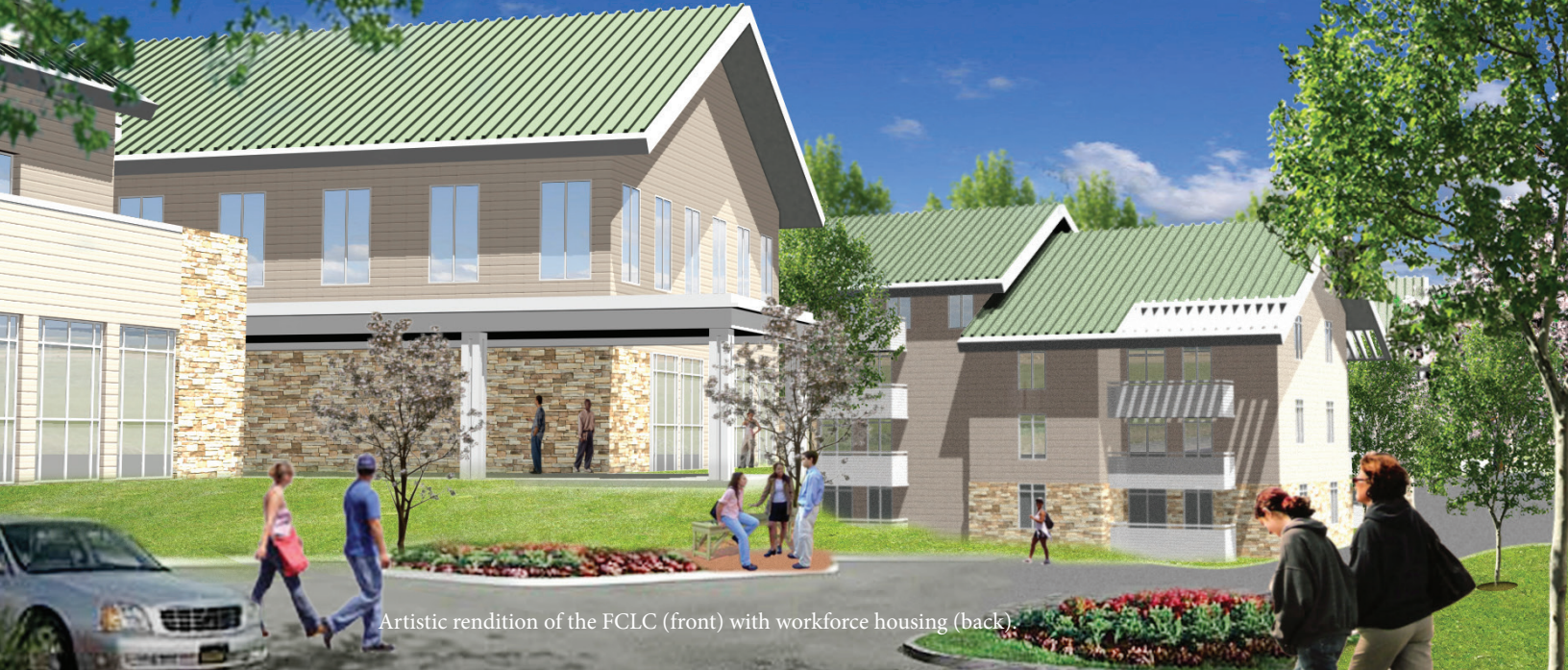
Artistic rendition of the FCLC (front) with workforce housing (back).